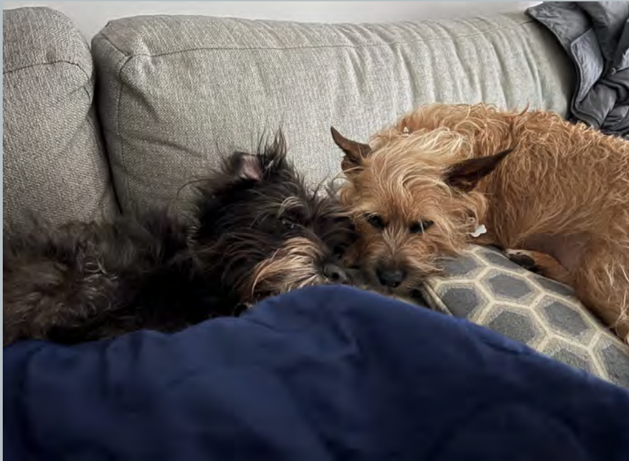
Aja's two dogs, Lolita & Tank